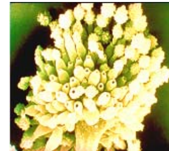
Electron microscope view of sporulation of Aspergillus flavus

Mold inhibitor containing propionic acid and/or ammonium di-propionate